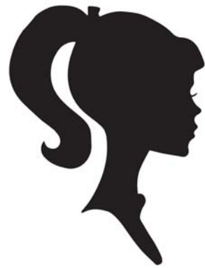
Queen of Sharing: This could be you!